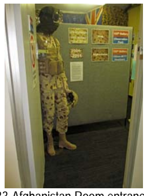
33-Afghanistan Room entrance