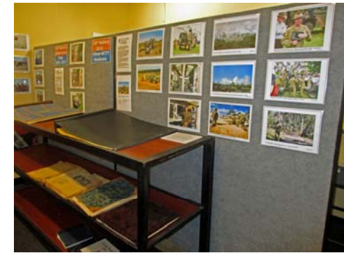
10-BR Obsn Bty M777 Howitzers