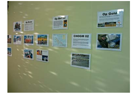
31-ETR Olympics CHOGM Bougainville and boat people