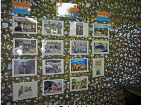
21-VR the blokes