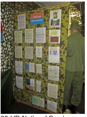
23-VR National Servicemen