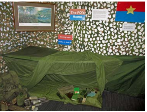
22-VR FO's home