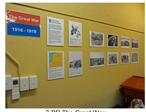
3-BR The Great War