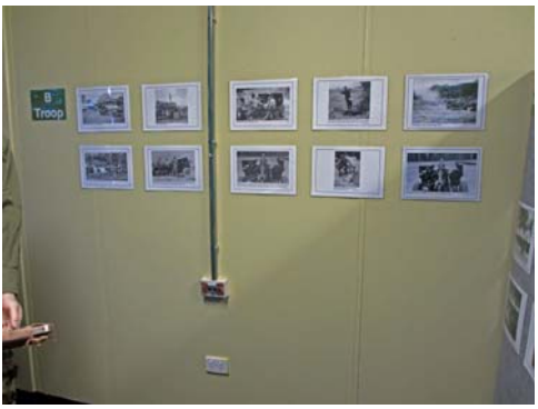
16-MR B Troop