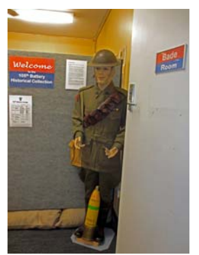
1-Bade Room entrance