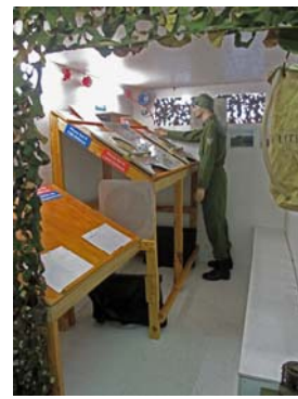
27-CPR inside the flying CP