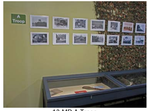
13-MR A Troop