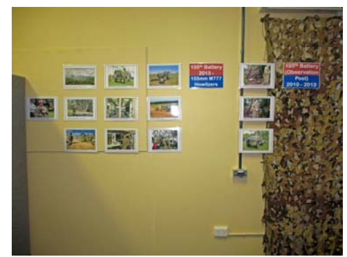
36-AR Observation Bty M777 Howitzers