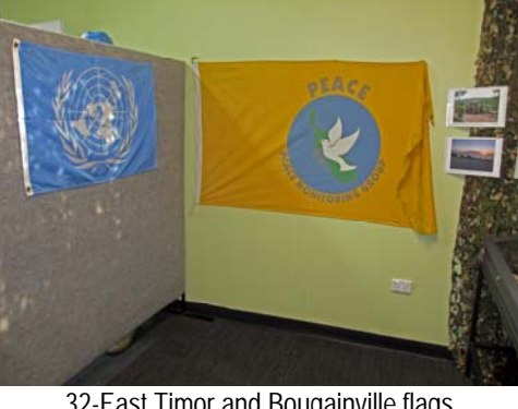
32-East Timor and Bougainville flags