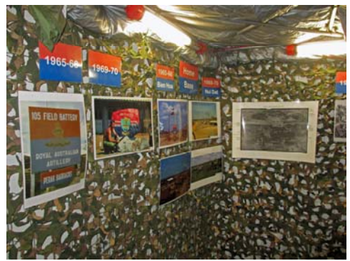
19-VR home bases