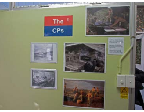
25-CPR types of CP