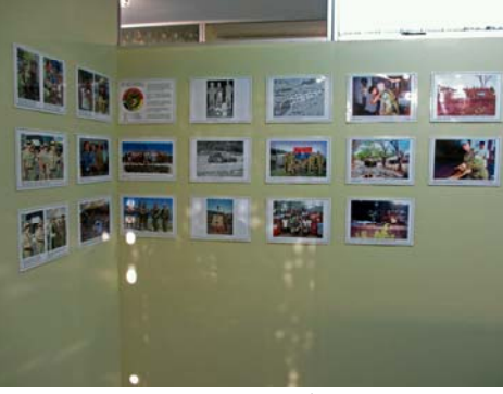
30-ETR East Timor