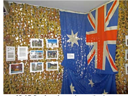
35-AR flag from forward operating base