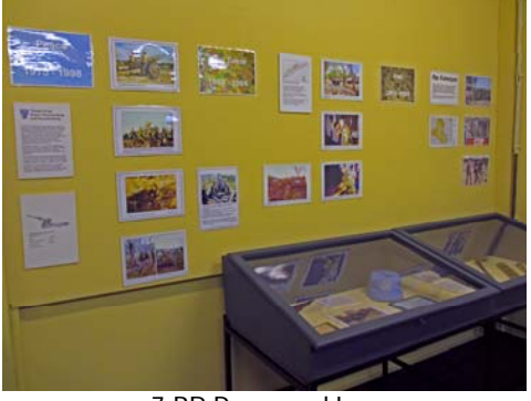
7-BR Peace and Iraq