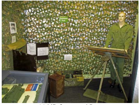
14-MR Command Post