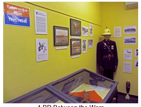
4-BR Between the Wars