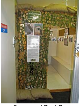
24-Vietnam Command Post Room entrance