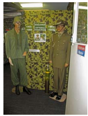
18-Vietnam Room entrance