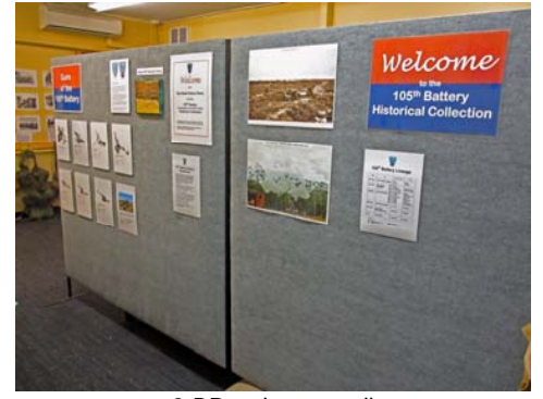
2-BR welcome wall