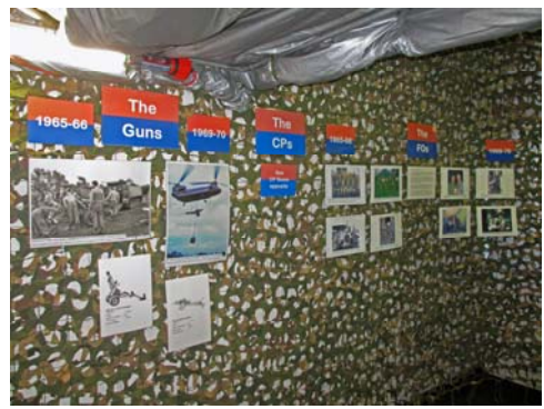
20-VR guns and forward observers