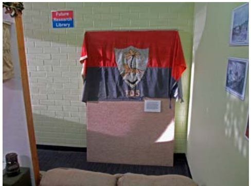
28-CPR bty flag future Research Library