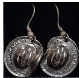
Earrings Silver & Gold